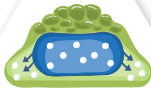
Other Lifting Agents

EverLift is Cellulose based and able to stay in place longer because it does not get absorbed as fast as other lifting agents. It does not get absorbed as fast, because: